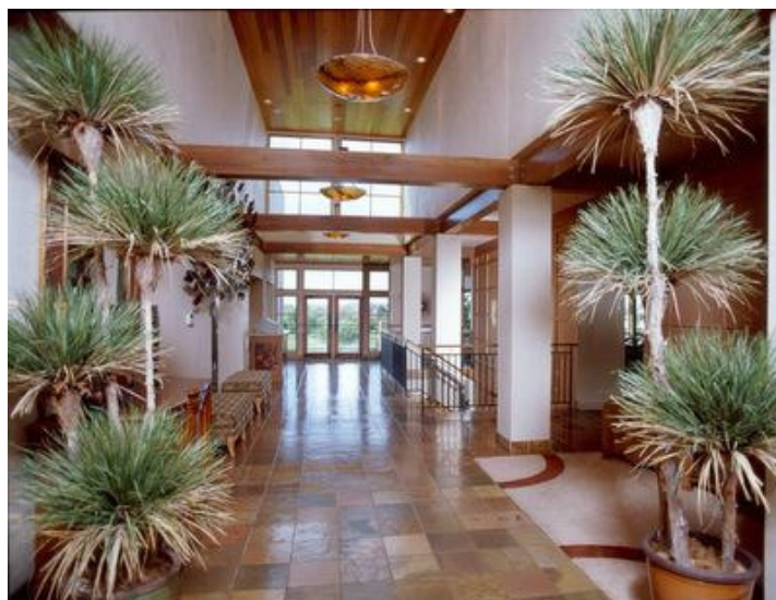
View of Meadows Springs Country Club entrance hall Visit the club's web site at http://www.meadowsspringscc.com/fw/main/default.asp

Only wine served by the Society may be consumed during our event.