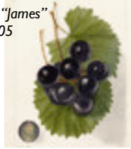
Vitis Sp. "James" 1905

Factoids: There are about 400 species of oak in the world. Only about 20 are used in making barrels. Of those, only 5 percent are suitable for the highest quality barrels. The average age of a French oak tree harvested for barrels is 170 years – sorry, no data for other countries. It takes one grape cluster to make a glass of wine. There are, on average, 75 grapes per cluster and four clusters will make a bottle. One barrel equals about 60 gallons, which equals 25 cases of wine. Source: http://www.stratsplace.com/beeson/wine_factoids.htm