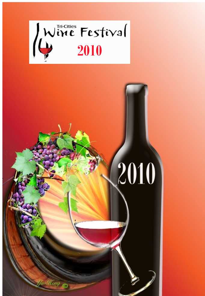
2010 Tri-Cities Wine Festival Artwork (Artist: Yu-Heng Dade)