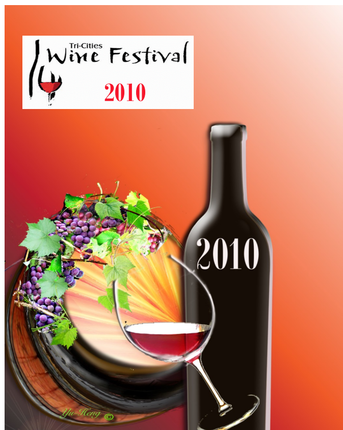
2010 Tri-Cities Wine Festival Artwork (Artist: Yu-Heng Dade)

The Society’s April event is a trip to the world’s southern hemisphere – New Zealand and a survey of its Pinot Noirs, including information on terroir and winemakers. The event committee is looking to obtain a selection of Air New Zealand 2009 gold-medal winners for tasting. Many of these wines are from small, up-and-coming wineries that often don’t make it our way. More details in future EVOEs . ♦