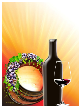
2010 Tri-Cities Wine Festival Artwork by Yu-Heng Dade