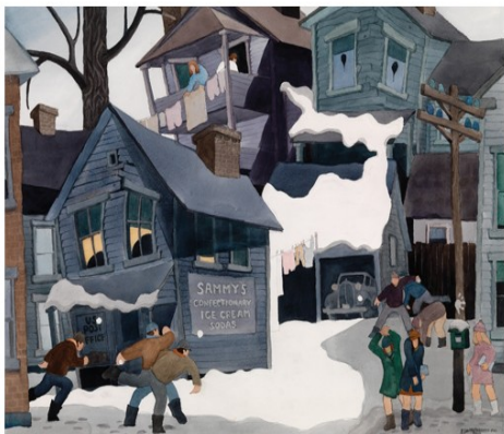
DONG KINGMAN AWARD with $500 Edwin C. Shuttleworth Boynton Beach, FL Snowball Fight #8 21-1/2" x 29-1/2"