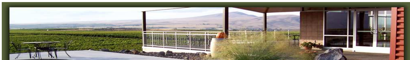
EVOE September 2010

Requests to attend an event as a “non-drinker” will be approved or disapproved on a case-by-case basis by the event’s committee. Decisions will be based on the type of event. ♦